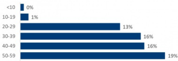
Percent of total COVID-19 case-patients by age group Wisconsin Electronic Disease Surveillance System, March 27, 2020 (n=842)